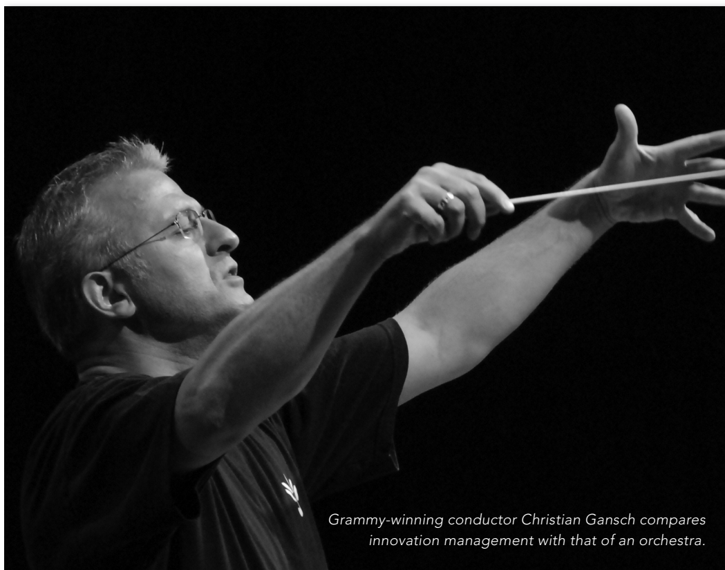
Grammy-winning conductor Christian Gansch compares innovation management with that of an orchestra.

Large companies are innovative along the sustaining trajectory, but fail in the development of transformational and disruptive innovation. Two of the reasons for this failure are that transformational and disruptive innovations require a new business model and lack a unifying development process comparable to stage gate. The lean start-up process represents a new paradigm which allows companies to dramatically shorten the time needed to 1) create transformational and disruptive innovation: 2) pivot to a new business model or 3) stop the project. However, most of the published examples are from small start-ups. Large companies, based on implementation experiences from over 30 large companies, typically make the following mistakes: 1) incorrect problem definition; 2) confuse solution attributes and the solution; 3) use the Osterwalder canvas rather than the FEI canvas; 4) focus on the wrong customers; and 5) fail to embrace early prototyping. Best practices to avoid these implementation mistakes will be presented.